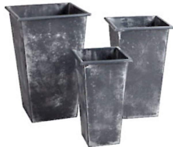
Incorporate Black Distressed Pots

Note: I would extend White Dove to the bottom of the sides of the garage