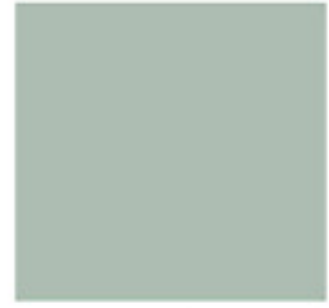
Farrow & Ball Green Blue