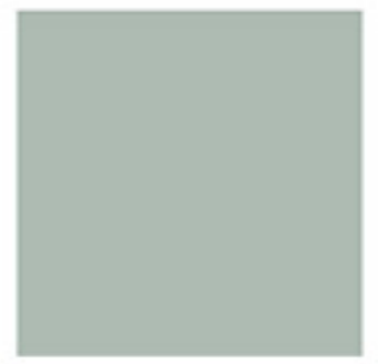
Sherwin Williams Quietude