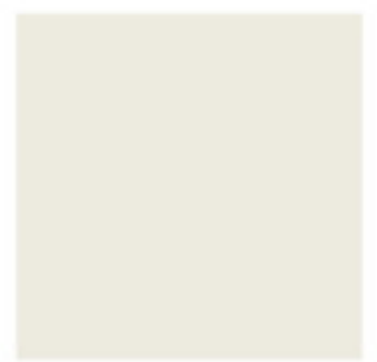
Sherwin Williams Alabaster