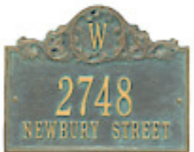
Unique Address Plaque Doesn't Need to Be This Color