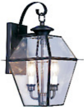
Black Carriage Light Not This One Specifically